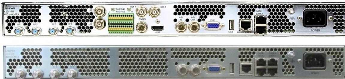
Figure 2. Synamedia D9800 Network TransportReceiver

Figure 2 shows the rear view of the Synamedia D9800 Network Transport Receiver single stream configuration and multi-stream.